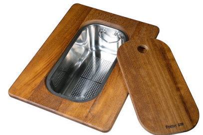
Iroko-wood sliding chopping board with stainless steel colander

* only in combination with the accessory 8644 101