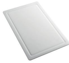
HDPE Chopping board 8657 001